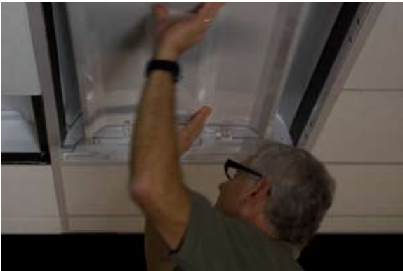
12. Squeeze Reflector Assembly and snap into tabs located on the Top Mount Bracket . Install lamps.