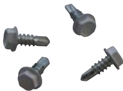
(4) Tek Screws