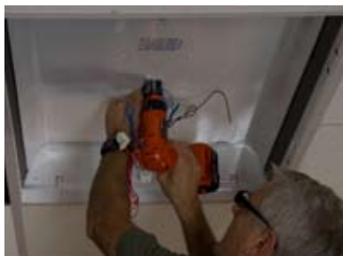
7. Install new Pre-wired Ballast in the center of the existing frame.