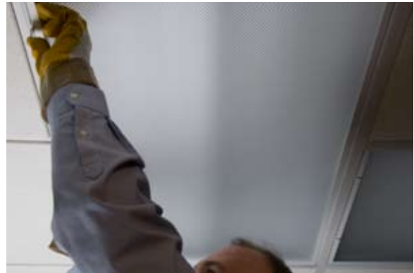
13. Swing existing door frame into place.