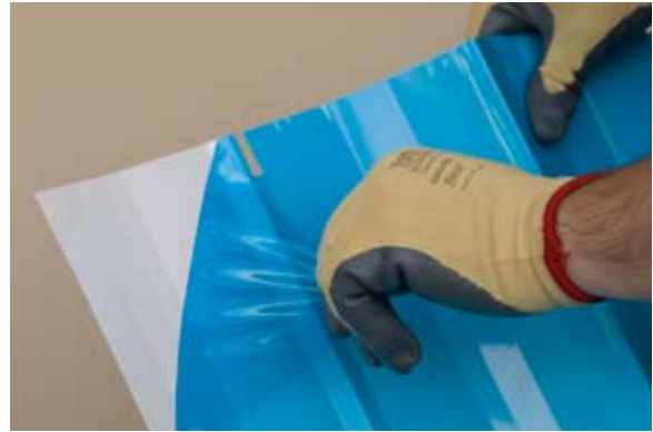
11. Remove protective film from Reflector .