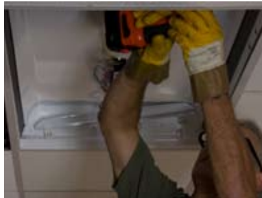
5. from both ends.