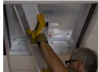
3. Remove ballast covers.