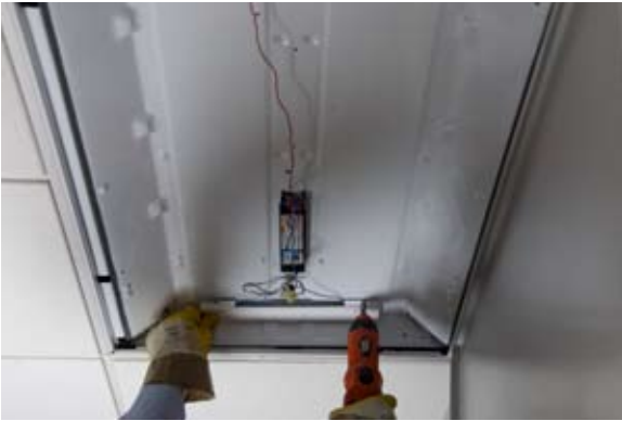
10. Center bracket and place adjacent to end cap. Using provided Tek Screws install both Top Mount Brackets to top wall of housing.