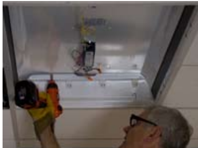
4. Remove sockets and socket brackets