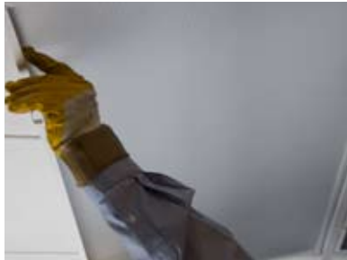
1. Lower door frame.