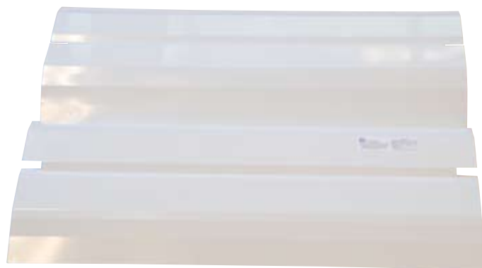
(1) 2' or 4' Reflector Assembly