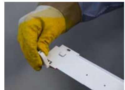
9. Insert sockets into Top Mount Brackets .