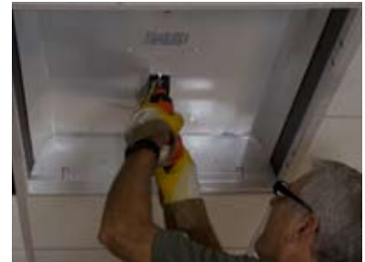
6. Disconnect power from the existing ballast, remove, and recycle.