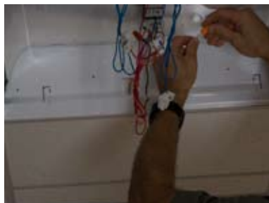
8. Wire ballast to power using provided disconnect