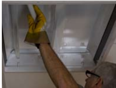
2. Remove lamps.